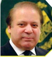
Nawaz Sharif Prime Minister of Pakistan

On the inauguration of the new refinery, I wish Byco greater progress in the forthcoming years and I look forward to Byco contributing towards the socio-economic development of the country.