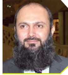
Jam Kamal Khan Minister of State, Petroleum & Natural Resources

The inauguration of Byco Refinery is a landmark event for the province of Balochistan. I wish all the success to Byco and hope that it will continue to contribute towards the development and prosperity of the country.