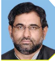
Shahid Khaqan Abbasi Federal Minister, Petroleum & Natural Resources

Pakistan's Oil and Gas sector is playing a pivotal role in meeting country's energy requirements. The security of sustainable supply of oil and gas and enhanced self reliance in this sector is essential for economic development and strategic requirements of the country.